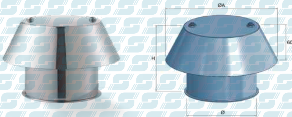
Preso aria coclea con fori - Auger air inlet with holes