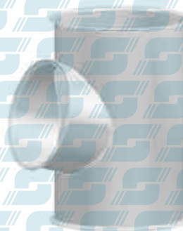
TUBI DI ISPEZIONE 75° INSPECTION SPOUTS 75°