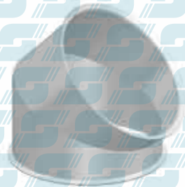
CURVA SALDATA WELDED BEND