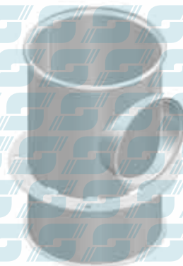
ISPEZIONE A PAVIMENTO PLANSICHTER INSPECTION SPOUT FOR FLOOR PLANSICHTER