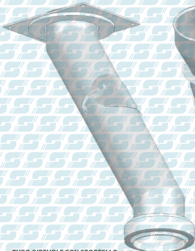
TUBO GIREVOLE CON SPORTELLO SWIVEL SPOUT WITH HINGED COVERS