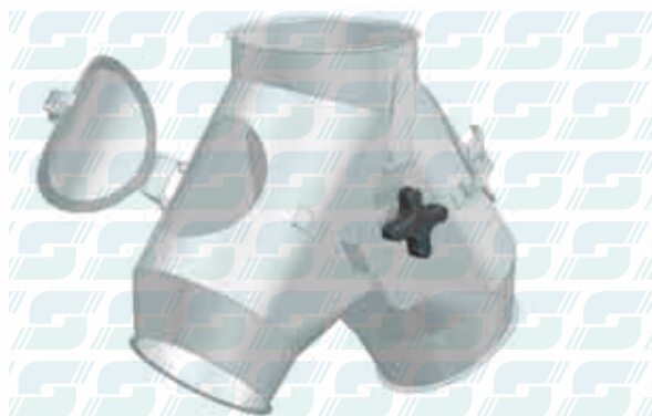
CASSETTA RIPARTITRICE CON SPORTELLI DISTRIBUTION BOX WITH HINGED COVERS