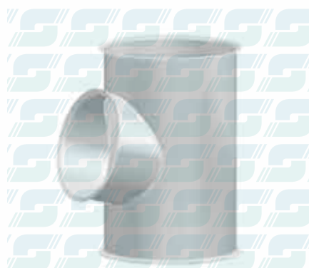
TUBI DI ISPEZIONE 75° INSPECTION SPOUTS 75°