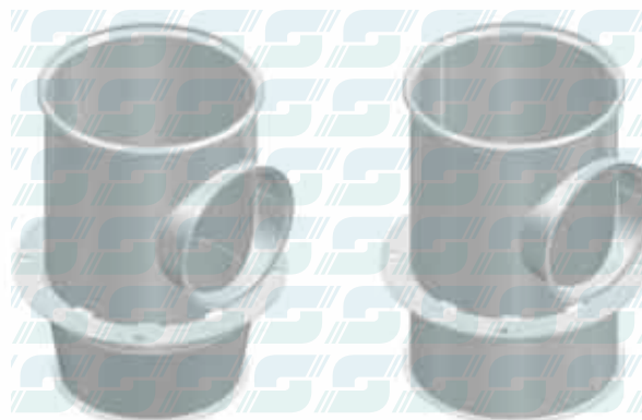
ISPEZIONE A PAVIMENTO PLANSICHTER INSPECTION SPOUT FOR FLOOR PLANSICHTER