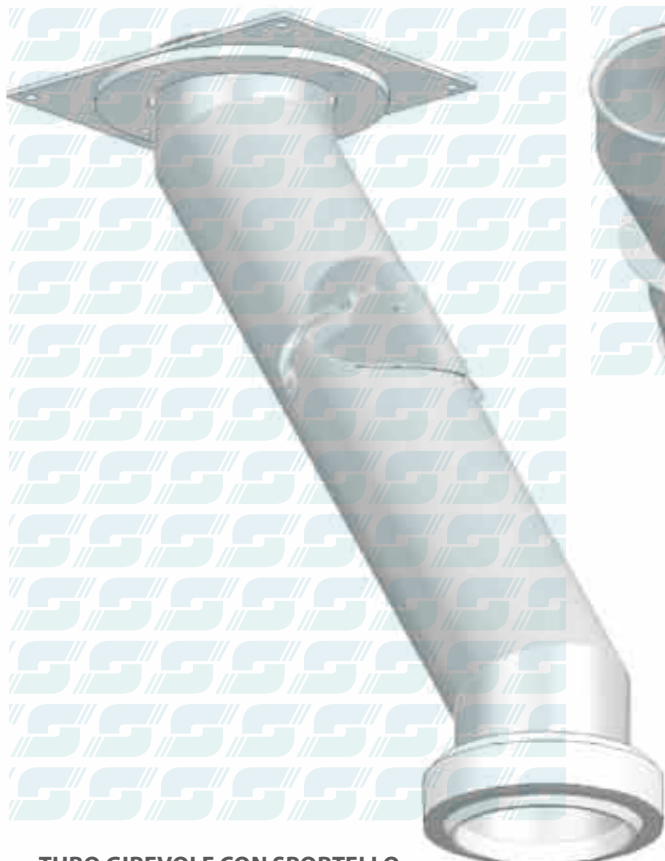
TUBO GIREVOLE CON SPORTELLO SWIVEL SPOUT WITH HINGED COVERS